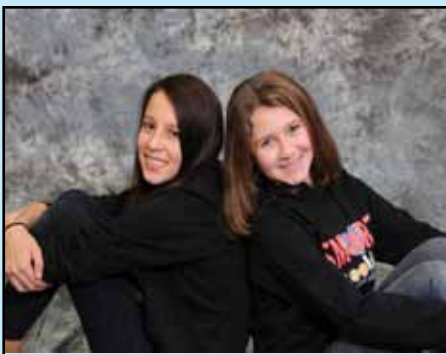
Winter photo shoot