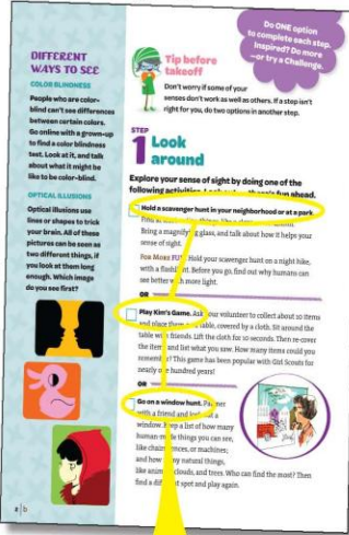
From the Brownie Badge: Senses

Three Choices: There are three choices for completing each step. Girls only need to do ONE.